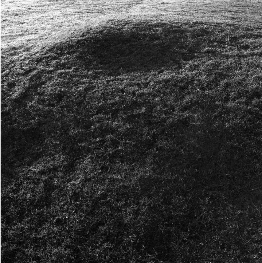
Figure 3. Anne Ferran, untitled , from 'Lost to Worlds', 2008. Courtesy of the artist.