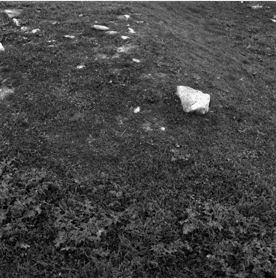
Figure 7. Anne Ferran, untitled , from 'Lost to Worlds', 2008.