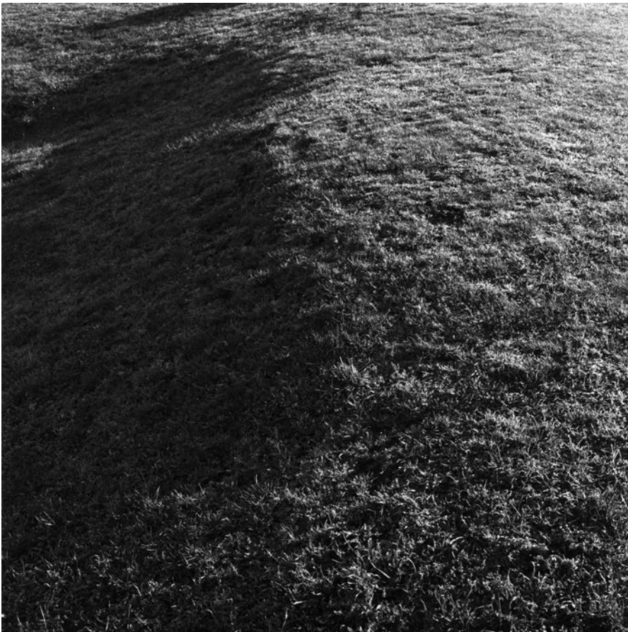
Figure 4. Anne Ferran, untitled , from 'Lost to Worlds', 2008. Courtesy of the artist.